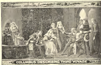
COLUMBUS DESCRIBING THIRD VOYAGE

SCENES FROM THE LIFE OF COLUMBUS FROM HISTORIC PAINTINGS EXHIBITED AT WORLD'S FAIR.